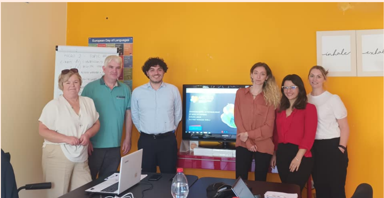
MICRO 2 Partner meeting in April 2023

Both project training offerings are designed to be easily accessible by the busy rural entrepreneur or would be entrepreneur. It is freely available for learners and organisations with a rural enterprise training purpose through the website. https://www.digitalmicro2.eu/index.php