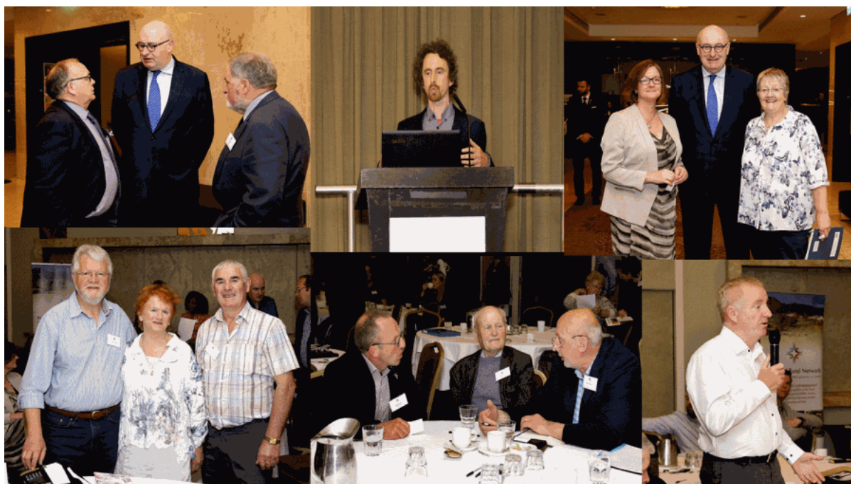
PHOTO GALLERY - IRL Annual Conference 2019

Applications are now open until 12 Noon on Friday 26th July 2019. Applications after this time will not be accepted. More information and download application form are available on http://www.welfare.ie/en/Pages/UN_Event.aspx