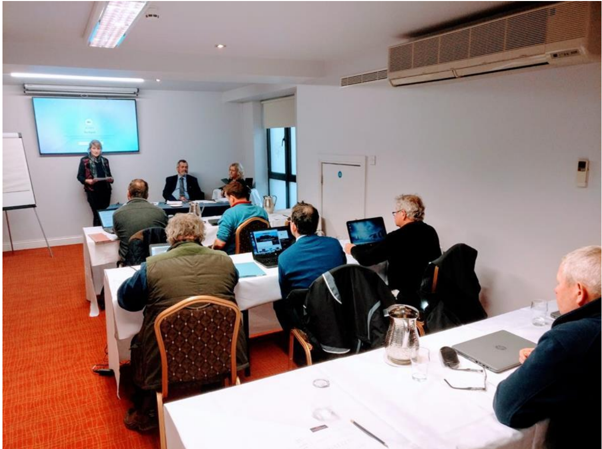
Participants and Tutors of 'Getting Citizens Online' classes that took place in Galway