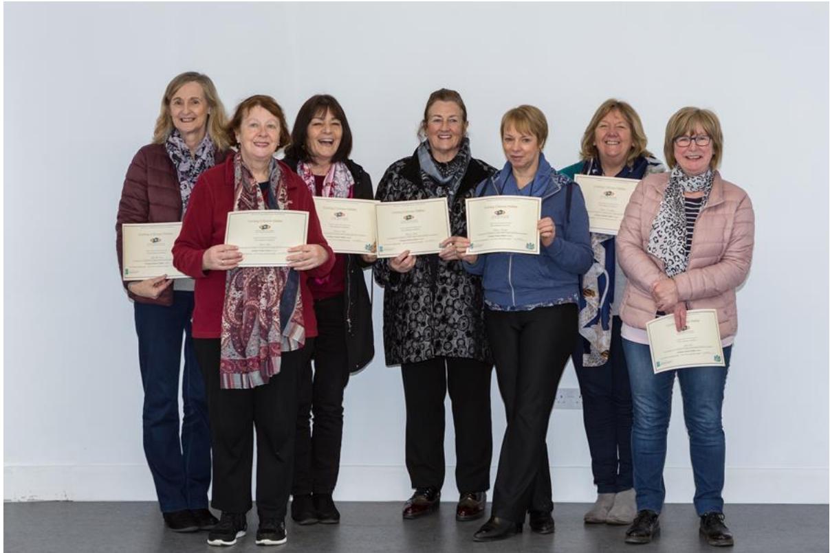
Participants who completed the 'Getting Citizens Online' Basic Computer Course receiving their certificates.

'Getting Citizens Online' and 'IT Skills for Farmers' basic computer classes continue to be delivered across the country. These classes run for 5 weeks, 2 hours a week and are FREE to attend. The classes are aimed at any person who has never used a computer before, with the classes teaching participants how to use the internet, online banking, email, pay bill online, Skype etc. The 'IT Skills for Farmers' courses help farmers to register calves and herd movements as well as the basic skills also.