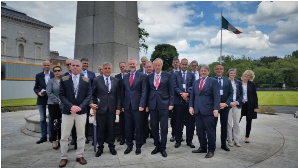
German Sparkassen Delegation following tour of Leinster House