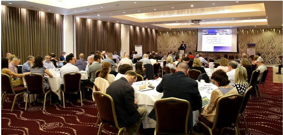
Rural Inspiration Awards